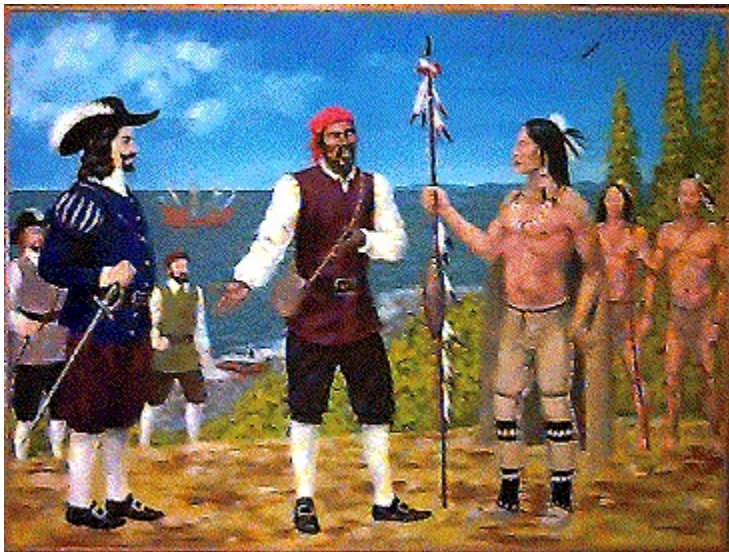
Mathieu Da Costa

Mathieu Da Costa was the first black person known to have come to Canada. In 1605 Mathieu Da Costa travelled from France to the new French colony of Port Royal, in today's Nova Scotia.