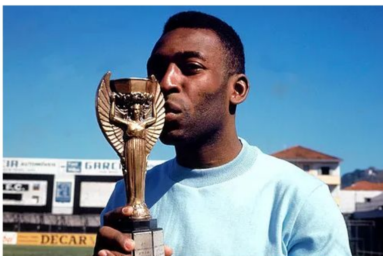
Figure 2: Pele kissing the Jules Rimet trophy.